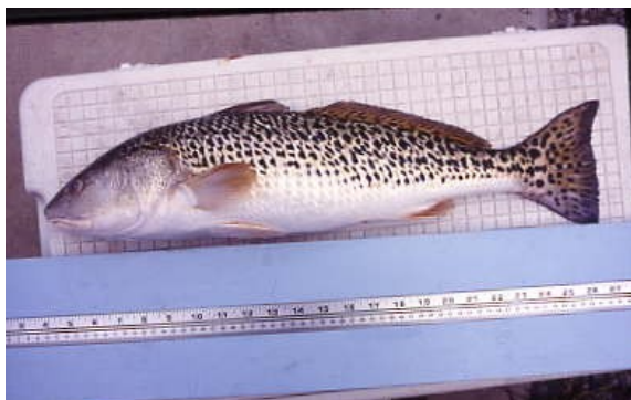
Can you count the spots?